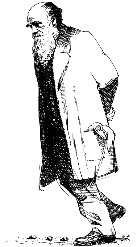
Figure 3. Charles Darwin engaged in the arcane and almost lost art that today we would label thinking.

If you can’t walk, try running. I have been a recreational jogger for 15 years. I sometimes find that a pain in my ankle that I feel when walking or jogging will go away if I switch to a sprint. This cure suggests a strategy to overcome writer’s block, which afflicts many scientists. The scenario I often observe is that someone finishes an experiment or field study and then sits down to “write up the results.” It reminds me of the Peanuts comic strip in which Snoopy is trying to write a great novel and keeps getting stuck on “It was a dark and stormy night.”